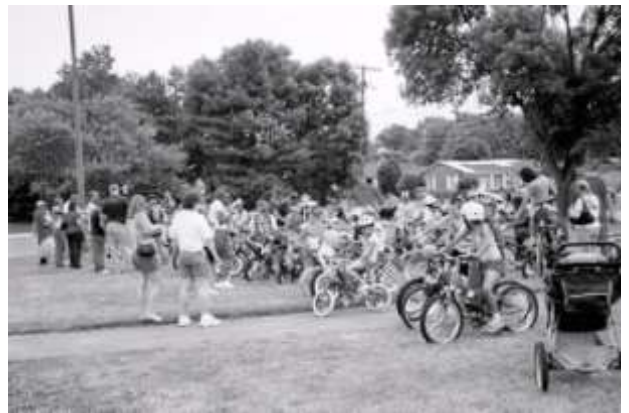
Assembly at Woodward Park Middle School. We had 36 entries in the 2009 contest.