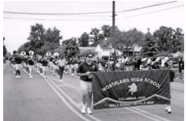
NORTHLAND HIGH SCHOOL MARCHING BAND IN FOURTH OF JULY PARADE

If you see trees adjoining your property marked with a painted X on the street side of the trunk, it means the tree is slated for removal (not necessarily due to the Ash Borer) and you may want to call the City Forester at 645-6648 about a replacement tree. The city will not automatically replace trees they remove. You can check with the OSU Extension Service Emerald Ash Borer Web site at http://ashalert.osu.edu/ for more information.