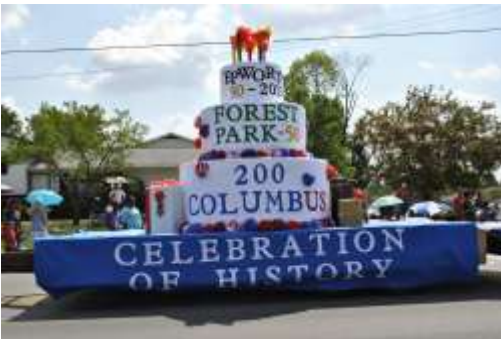
Epworth Church's float