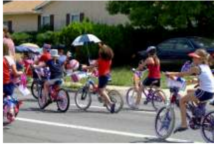
Some of the Bikes & Trikes from Forest Park