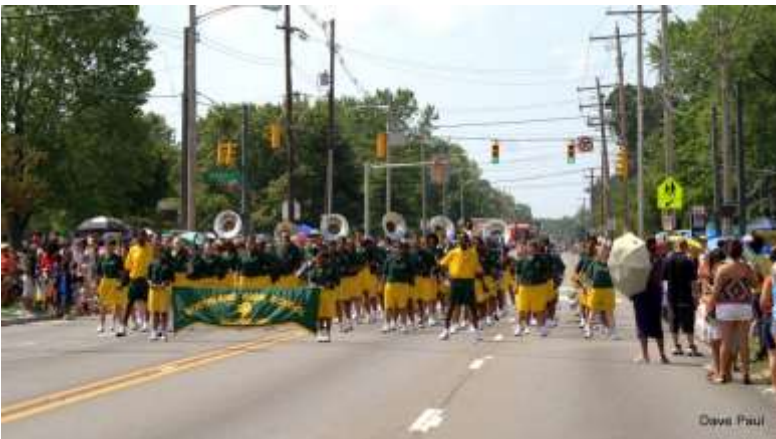
Northland High School Marching Band