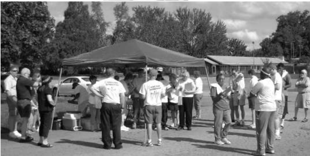
Volunteers are getting instructions and materials from the Outreach Committee.