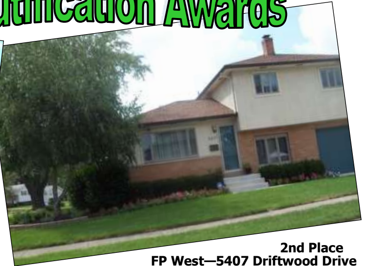
2nd Place FP West—5407 Driftwood Drive

161 Task Force Clean Up Saturday October 8th Meet at Sharon Woods Ctr. Behind Jiffy Lube