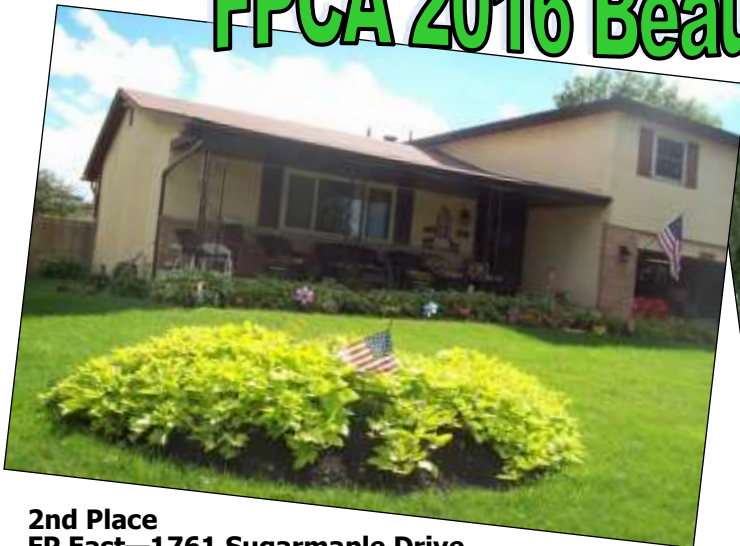
2nd Place FP East—1761 Sugarmaple Drive