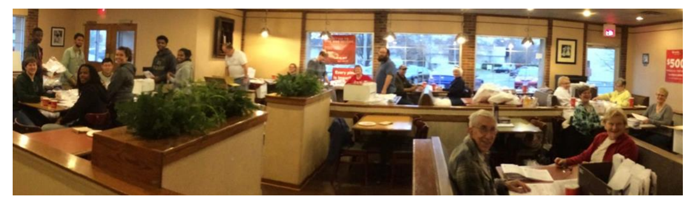
We are grateful to Donato's on Tamarack Circle for the use of the dining room for our stuffing parties.

Let George know if you would like to help stuff. It usually takes from 2:00-4:00 pm. Stay as long as you can