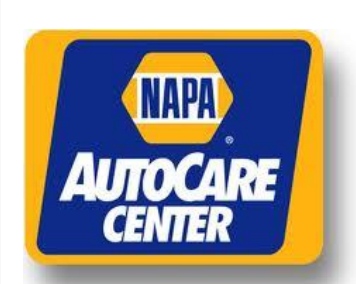
Scott Petty Proudly serving the Forest Park area since 1990

FOR MOST CARS UP TO 5 QTS. NOT VALID WITH OTHER DISCOUNTS `EXPIRES 02/28/2017