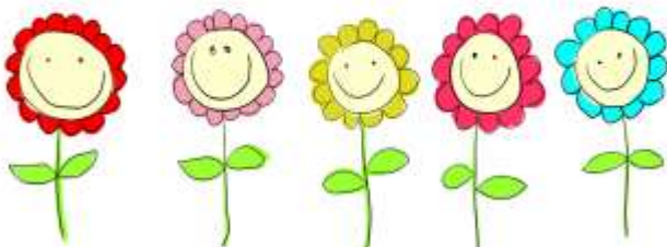
Lora Hartzell, Beautification chairperson

We will be looking in the month of June for beautiful Front Yards in Forest Park. We will select winners in early July. Get your Yards ready with wonderful BLOOMS.