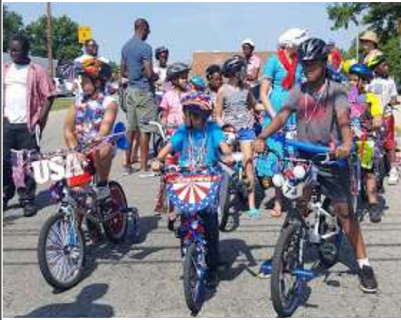
Parade watchers & participants