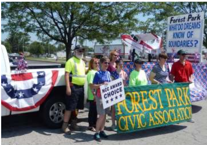
Folks from Forest Park pose with their NCC Award for their float design for the 4th of July Parade. This is the 55th year for the Northland Parade, and Forest Park has always been a proud part of this Columbus neighborhood 4th of July celebration!