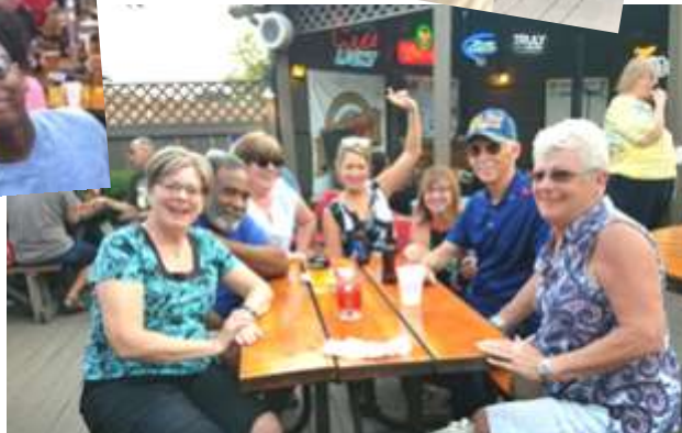
Forest Park neighbors enjoying the beautiful summer evening at Gabby's in June for FPCA night. Thanks to all who came.

All of Forest Park pick up is still on Fridays, we are Part B of the Friday Program.